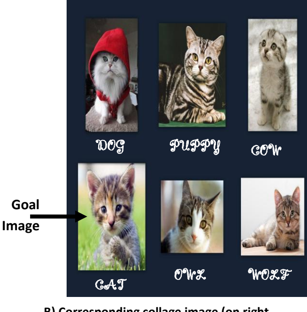
B) Corresponding collage image (on right hand side of the screen